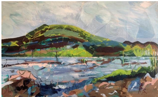
'RETREATING WATERS' OIL ON HAND STRETCHED CANVAS 80CM X 129CM

The use of geometry, in particular geometric pattern is something that has occurred in Helen's art work periodically, and this exhibition shows how this has now become more focussed as she begins to explore the space in between a landscape and introduces a spiritual thinking into the relationship between people and nature.